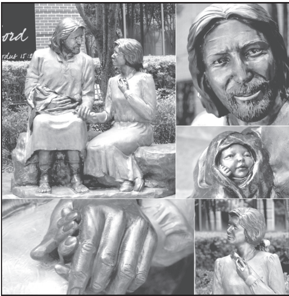
Hope Monument at CHRISTUS St. Michael Hospital Serenity Garden