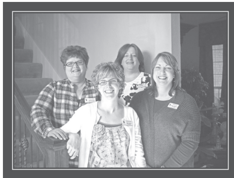
M.E.N.D. - NW Washington