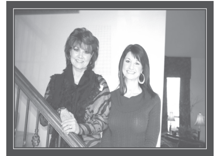
M.E.N.D. - Hot Springs