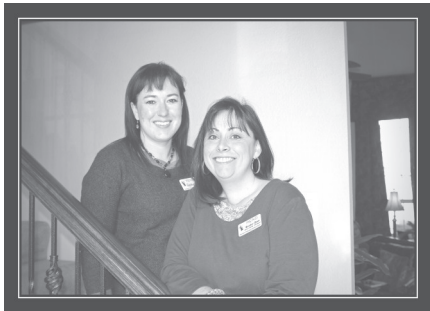
M.E.N.D. - SW Missouri