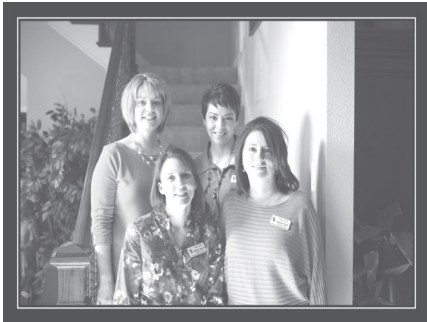
M.E.N.D. - Amarillo