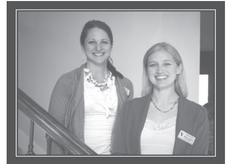
M.E.N.D. - Houston

A special thank you to all the donors who helped open M.E.N.D.-Wichita Falls