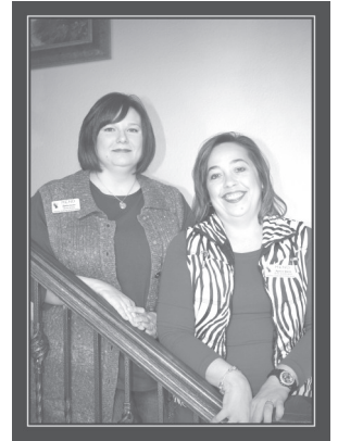
M.E.N.D. - Texarkana