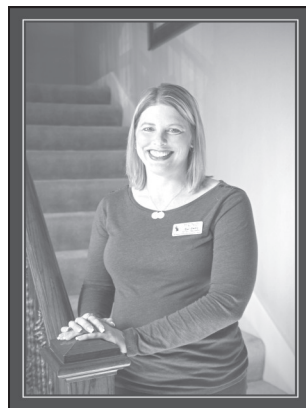
M.E.N.D. - Tulsa

A special thank you to all the M.E.N.D.-Bryan/College Station BUNCO Bash sponsors