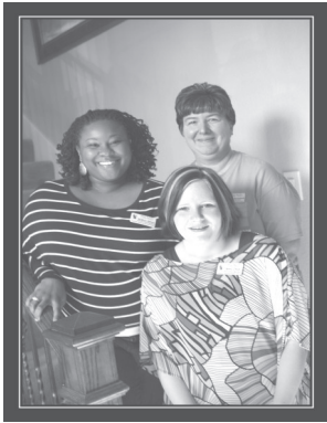
M.E.N.D. - Bryan/ College Station

Thank you to all who attended the 2012 Leadership Conference. The leadership conference helped us to prepare our minds and hearts for families in need over the next year.